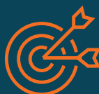
Stress Management Gaming