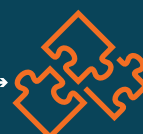
Adoption of Stress Management techniques